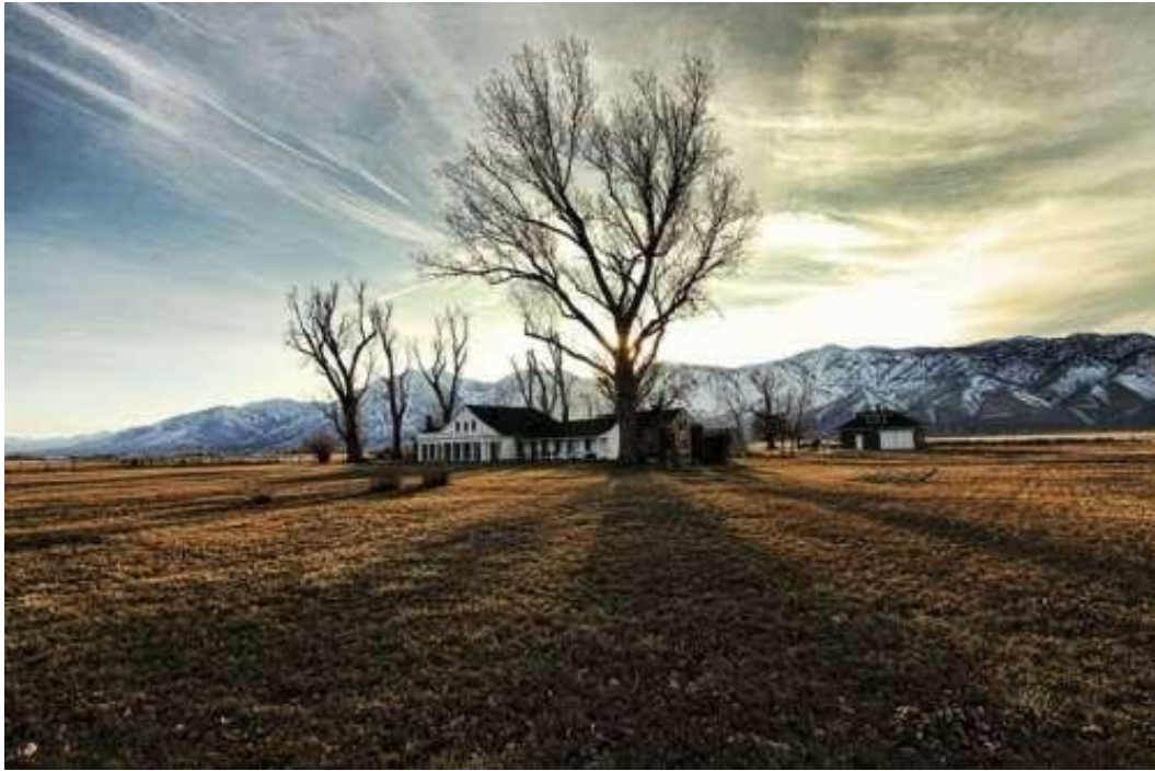
Dangberg Home Ranch