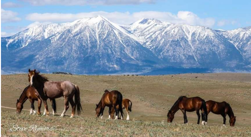
Nevada's Wild Horses

For a complete gallery of the Photographer Spotlight Series, visit online. More amazing photos can be found on Instagram and at the Visit Carson Valley website . As beautiful as each photographer's shots are, nothing is better than capturing one's own moment in time. For more on visiting Carson Valley, please click to VisitCarsonValley.org .