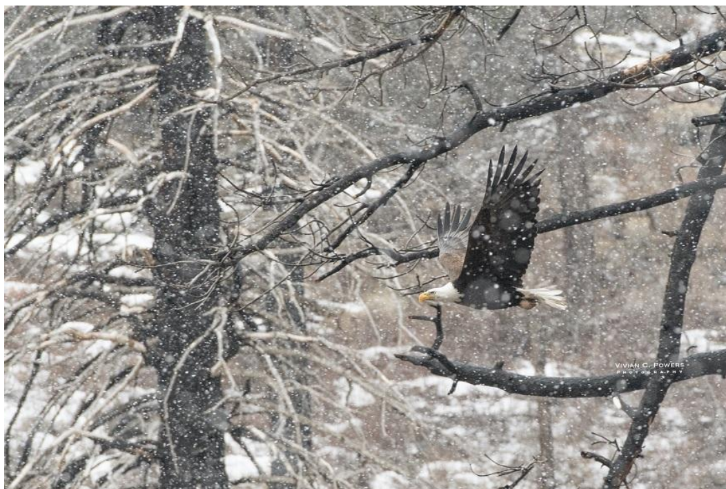
Bald Eagle

Landscape photographers will appreciate the scenes along the Carson River at River Fork Ranch , an 800-acre preserve owned and operated by the Nature Conservancy. With the Carson Range of the Sierra Nevada rising to the west and its banks flanked by key wetland, meadow and riparian habitats, the Carson River displays landscape splendor year round. Known as the desert gem, Topaz Lake is a picture window to eastern Sierra Nevada landforms, equally beautiful with each changing season. Photographers in pursuit of solitude will find the Pine Nut Mountains captivating with its rock formations, diverse geology and desert geography in a remote setting.