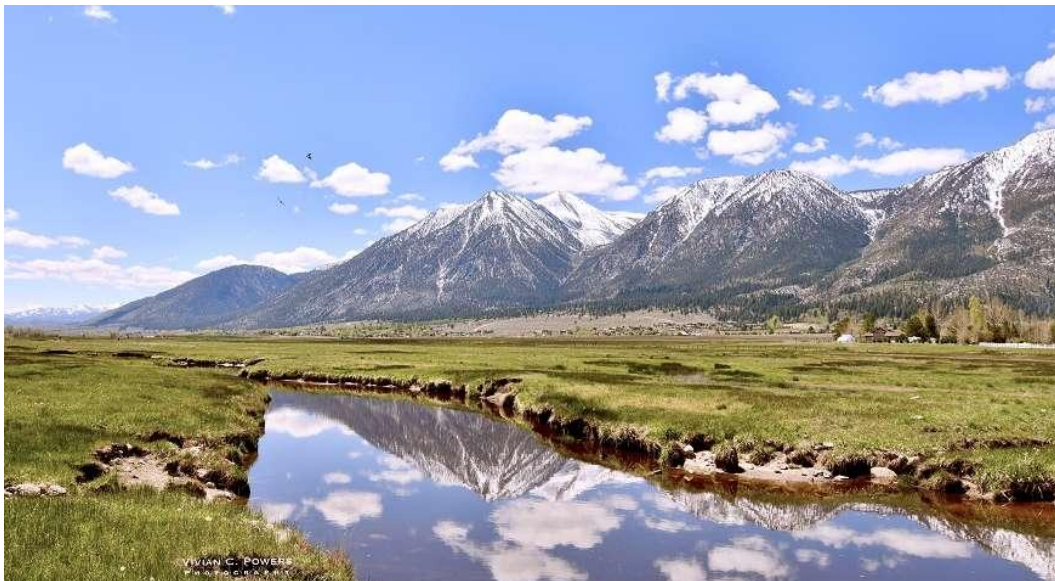
Carson River

To capture historical anecdotes, full of texture and century-old stories, visitors can explore the Carson Valley community of Genoa , Nevada's first permanent settlement and home to the Genoa Bar , Nevada's oldest thirst parlour. Architectural photographers will appreciate the scenes at the JT Basque Bar & Dining Room in Gardnerville . The historic building and delicious food have deep roots in the region's rich Basque history. Still life photographers will marvel at the photo opportunities at the Dangberg Home Ranch Historical Park where a fascinating collection of artifacts and historical ranching scenes can be shot as well as the haven it provides for raptors and owls.