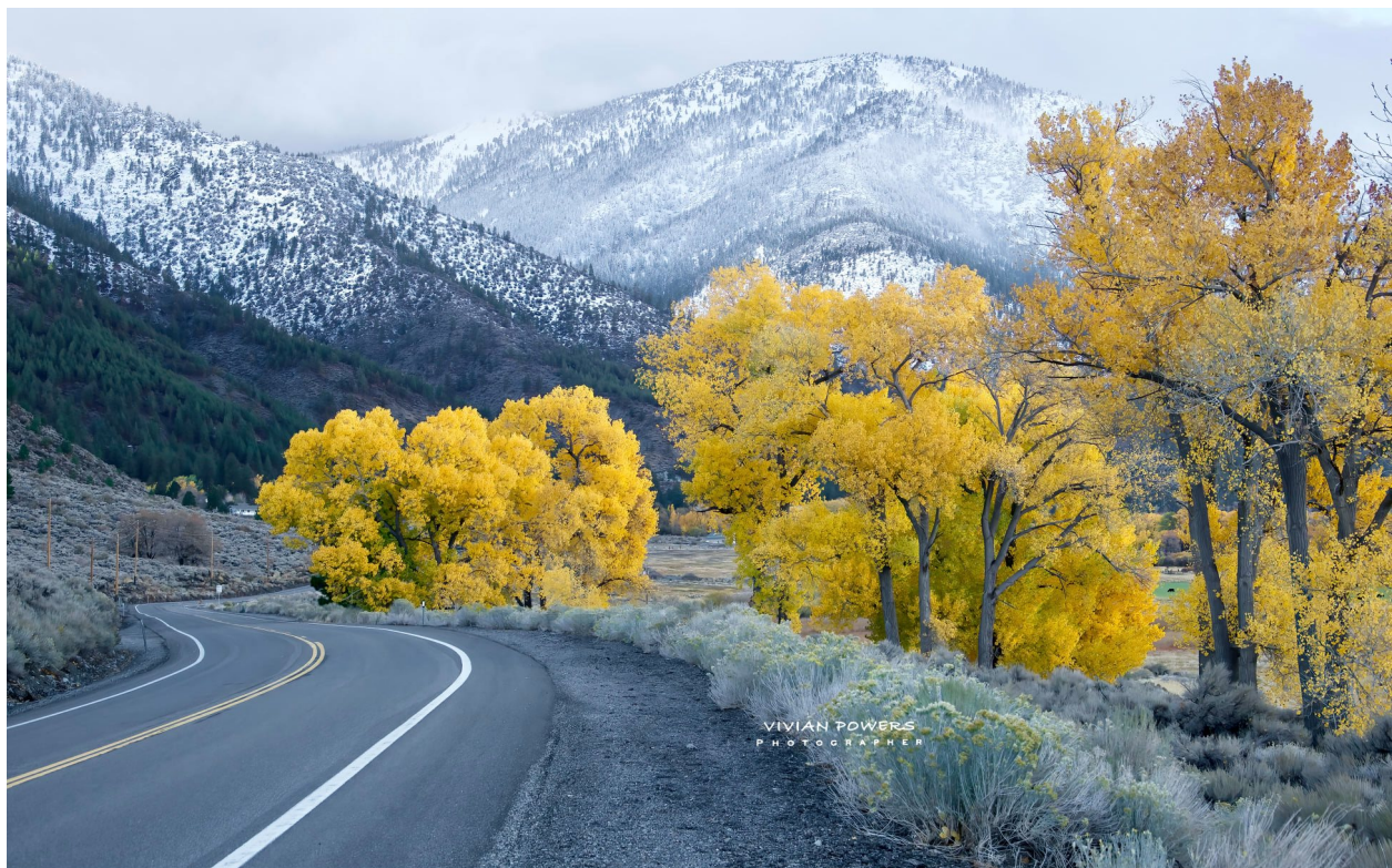
Nevada's oldest settlement, Genoa, Nevada, Oct. 27, 2021; photo credit: Vivian Powers Photography

CARSON VALLEY, Nev. (Nov. 3, 2021) – Winter has made an early appearance in the Sierra Nevada with record October precipitation in northern Nevada. The mountain peaks around Carson Valley are capped with feet of snow and nearby ski resorts are preparing for their earliest openings in as many as 70 years. It's time to dust off the snowsports gear, pack cozy sweaters, find the perfect fireside book and plan a winter escape to Carson Valley, a charming western ski town.