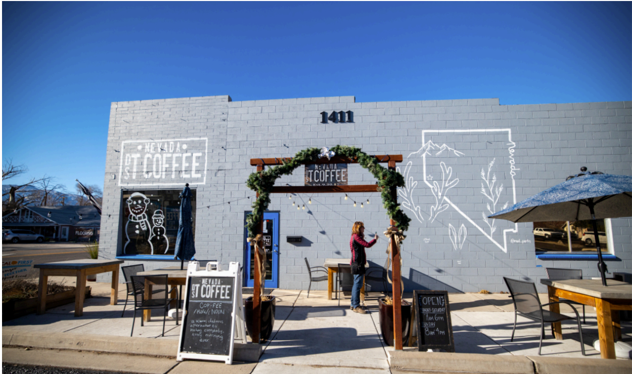
DST Coffee, main street Gardnerville, Nevada